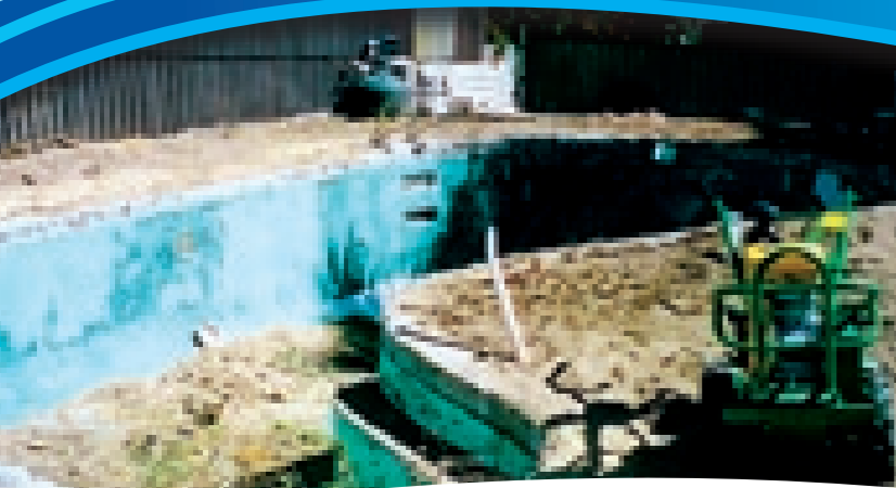
Refurbish your old inground pool from this...